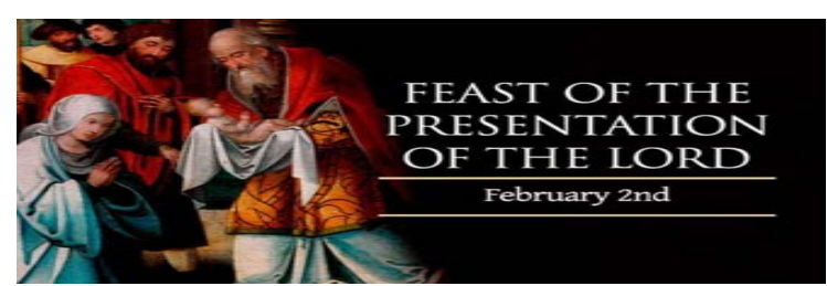
On Tuesday, February 2nd at our live-stream Mass at 7pm we will celebrate the Feast of the Presentation of the Lord.

Live-Streamed Masses are available on You Tube at the scheduled Mass time. If you miss that time, once the Mass has finished, it will take a few hours for it to show on You Tube. Sometimes the delay is taking a bit longer but if you search for St. Michael Waterloo and the date you may find it easier.